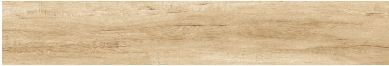
Dogma Project Antibacterial Ottawa Miele Levigato 20 cm x 120 cm

DOGMA® presents a new range of hygienic products DOGMA PROJECT ANTIBACTERIAL . The application of new technical glazes capable to stop the reproduction of bacteria guarantees antimicrobial protection to surfaces, ensuring a healthy environment, free of dirt and odor. The new technology applied to our ceramic tiles is ideal for all locations, especially with bacterial growth, such as kitchens, bars, restaurants, hotels, doctor's offices, schools, public offices, baths, SPAs and swimming pools. Ideal for personal and commercial use. DOGMA PROJECT ANTIBACTERIAL achieves the progressive elimination of bacteria by blocking growth, interrupting their life cycle.