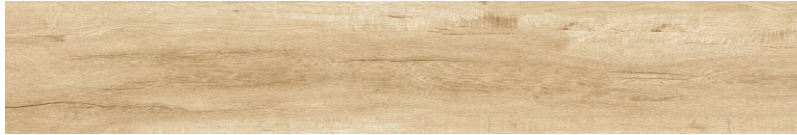
Dogma Project Antibacterial Ottawa Miele Natural 20 cm x 120 cm

DOGMA® presents a new range of hygienic products DOGMA PROJECT ANTIBACTERIAL . The application of new technical glazes capable to stop the reproduction of bacteria guarantees antimicrobial protection to surfaces, ensuring a healthy environment, free of dirt and odor. The new technology applied to our ceramic tiles is ideal for all locations, especially with bacterial growth, such as kitchens, bars, restaurants, hotels, doctor's offices, schools, public offices, baths, SPAs and swimming pools. Ideal for personal and commercial use. DOGMA PROJECT ANTIBACTERIAL achieves the progressive elimination of bacteria by blocking growth, interrupting their life cycle.