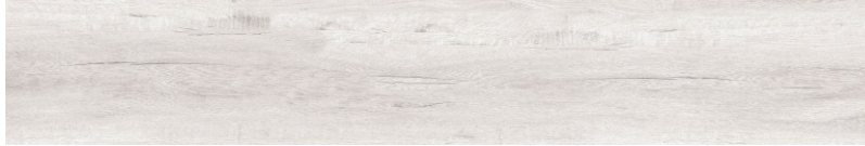
Dogma Project Antibacterial Ottawa Bianco Natural 20 cm x 120 cm

DOGMA® presents a new range of hygienic products DOGMA PROJECT ANTIBACTERIAL . The application of new technical glazes capable to stop the reproduction of bacteria guarantees antimicrobial protection to surfaces, ensuring a healthy environment, free of dirt and odor. The new technology applied to our ceramic tiles is ideal for all locations, especially with bacterial growth, such as kitchens, bars, restaurants, hotels, doctor's offices, schools, public offices, baths, SPAs and swimming pools. Ideal for personal and commercial use. DOGMA PROJECT ANTIBACTERIAL achieves the progressive elimination of bacteria by blocking growth, interrupting their life cycle.