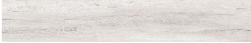
Dogma Project Antibacterial Ottawa Bianco Levigato 20 cm x 120 cm

DOGMA® presents a new range of hygienic products DOGMA PROJECT ANTIBACTERIAL . The application of new technical glazes capable to stop the reproduction of bacteria guarantees antimicrobial protection to surfaces, ensuring a healthy environment, free of dirt and odor. The new technology applied to our ceramic tiles is ideal for all locations, especially with bacterial growth, such as kitchens, bars, restaurants, hotels, doctor's offices, schools, public offices, baths, SPAs and swimming pools. Ideal for personal and commercial use. DOGMA PROJECT ANTIBACTERIAL achieves the progressive elimination of bacteria by blocking growth, interrupting their life cycle.